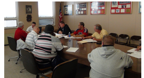
The negotiating committee for the 2013 Zenith Agreement meets to discuss contract proposals

Talks with Zenith Logistics began in early December to negotiate the 2013 agreement. The Negotiating committee first met in late November to streamline its approach to deliver a fair agreement to the membership at the Kroger Warehouse facility.