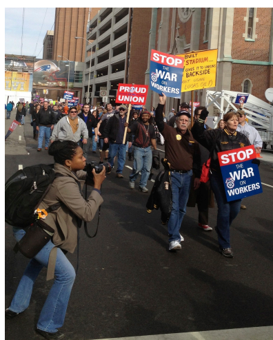
A reporter scrambles to take photos as protesters flood the streets in an unplanned march on Super Bowl Village. Thousands walked the distance from the Statehouse to the village in protest of the passage of Right-to-Work.

The International Brotherhood of Teamsters, seeking to derail Indiana's "race to the bottom", made a call to all Indiana local unions to mobilize their membership against this destructive legislation. Local 89, having jurisdiction over several counties in southern Indiana, had already begun to develop a strategy in mid-December. Pulling members off their work duties, Local 89 created and executed a plan to resist and block the bill's passage.