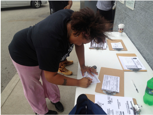
UPS Louisville Centennial Hub members showed a high level of participation in the 2012 voter registration drive.