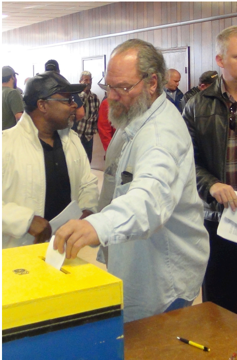
Transervice members showed high participation in their contract vote

Transervice, one of two Teamster employers at the Kroger Distribution Center, overwhelmingly approved their 2013 contract with a vote of 126 “for” and only two “against”. Participation