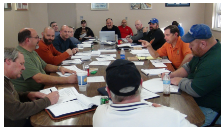
The 2013 Air Supplement Negotiating Committee represents a range of areas in the Air District

The Negotiating Committee for the next UPS Louisville Air Supplement, (commonly known as the Air Rider) began meeting last September to discuss and narrow down the hundreds of contract proposals submitted by the membership. The proposals ranged from changes work place rules and