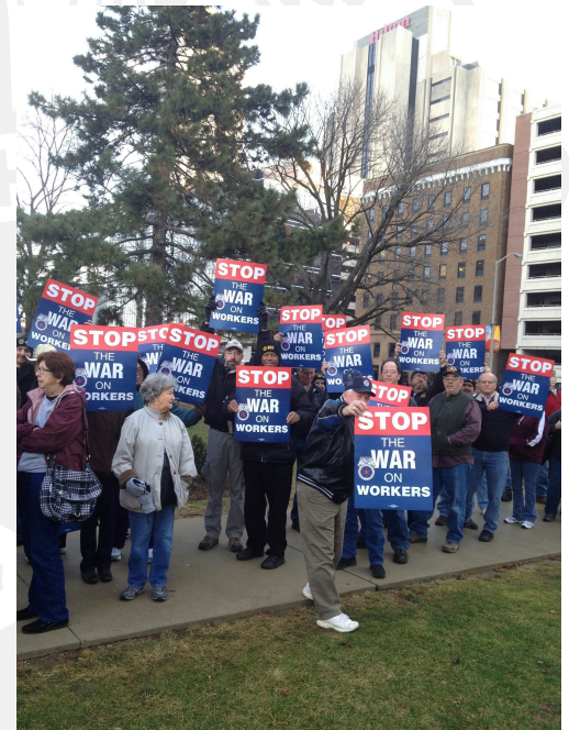
Teamsters and allies gather outside the Indiana Statehouse awaiting entrance. Often the wait was over two hours in inclement weather.