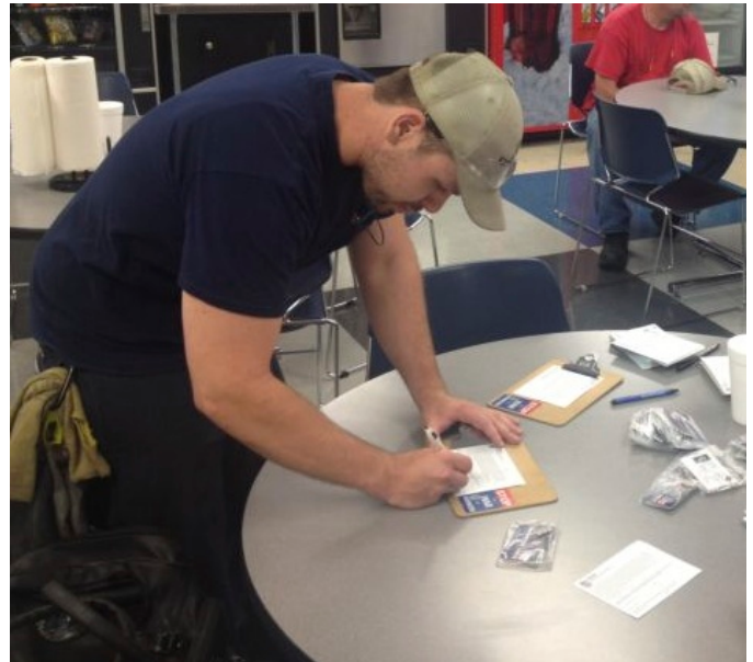
Members in Bowling Green showed a high level of solidarity and participation in DRIVE

In April, Local 89 began a very successful campaign to increase participation in DRIVE (Democrat, Republican, Independent, Voter Education). DRIVE fuels the political activities of the Teamsters union in protecting not only the rights we have established through our contracts, but those residing in federal, state and municipal law. This