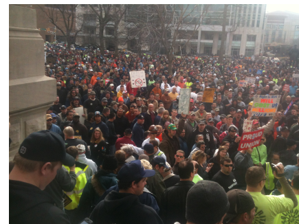
Workers rally en masse outside the Statehouse in Indianapolis

labor found no resistance from those who wished to prosper politically through the astronomical campaign contributions they would receive in exchange for pushing the anti-worker agenda. Politicians in the Indiana Statehouse were no exception to this rule and rapidly moved to push wage-killing legislation as the political climate in Indianapolis became more susceptible to its passage.