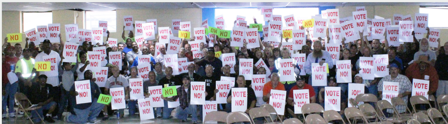
Carhaul members angry at the concessionary NMATA Tentative Agreement show their solidarity by holding VOTE NO signs.

Note: Due to production and shipping time it is possible you will receive this newsletter and read this article after the vote count has already taken place.