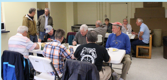
The Retirees Chapter cooks breakfast every Thursday morning at the new Retirees Building next to the union hall.

Dues for retirees are only $25 per year and include all meetings and functions. For more information, contact Kim Wolfe.