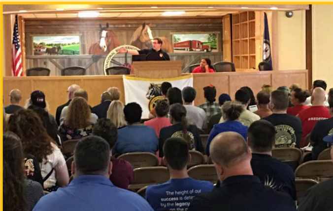
Members and activists from dozens of unions and organizations attend Labor Notes Troublemakers school at Local 89 in Louisville.