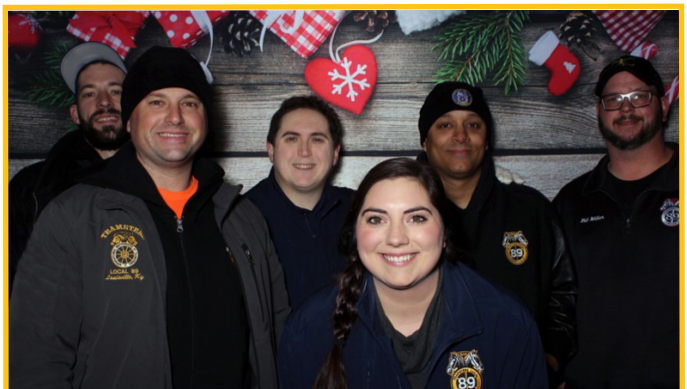
Local 89 staff and members volunteer at the "Boxes of Love" event to help feed needy families during the Holidays.