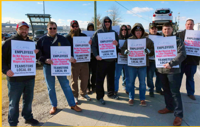
Local 89 Sets Up Picket outside of Ford LAP against Class Custom Carriers for attempting to do Teamster work.