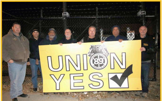
Workers at DSI Tunneling successfully vote to unionize as members of Teamsters Local 89.