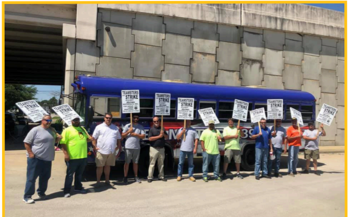
Officers, Agents, and Members take the Local 89 bus to join an ultimately successful IMI strike in Evansville.