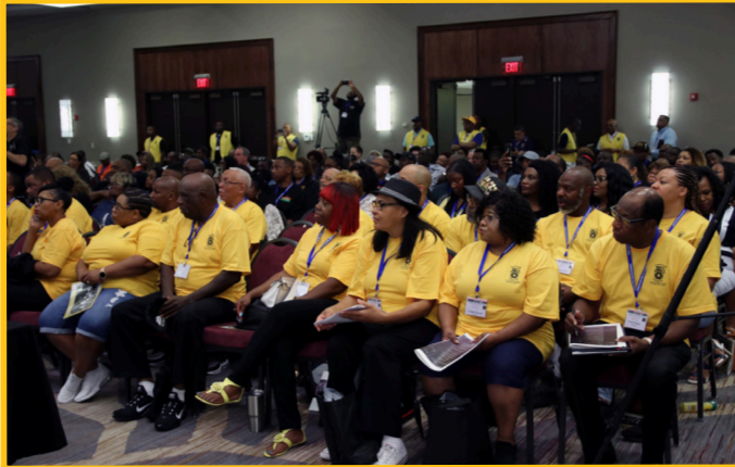
Local 89 Officers and Members attend the TNBC Conference in Louisville.