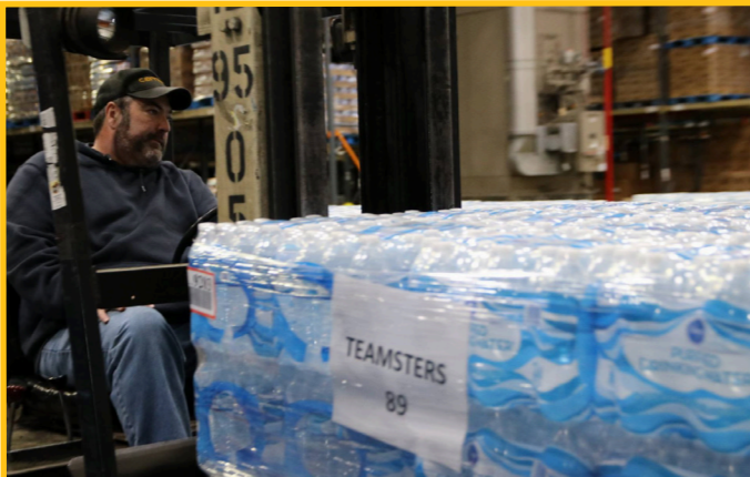
36,000 bottles of water from Local 89 and Local 783 are delivered to Martin County, Kentucky after their water pipes were contaminated.