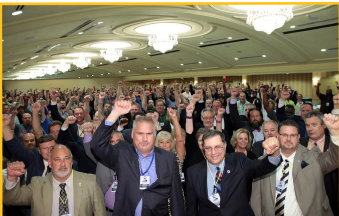
Over 250 Stewards attend the 2019 Steward Leadership Conference.