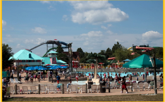
Thousands of Local 89 and Local 783 members attend Teamster Day at Kentucky Kingdom.