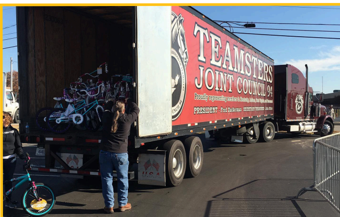
Local 89 members help load and deliver hundreds of bikes in the "Bikes or Bust" event, where they were later given to children in need.