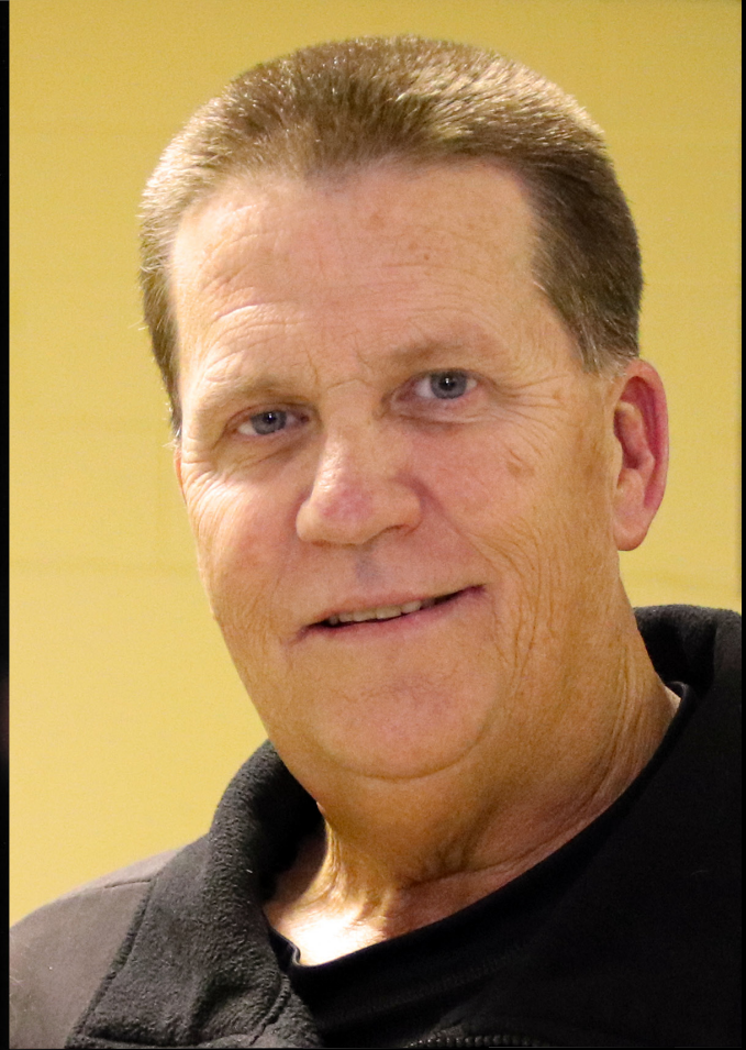
Teamsters Local 89 General Meeting March, 2019