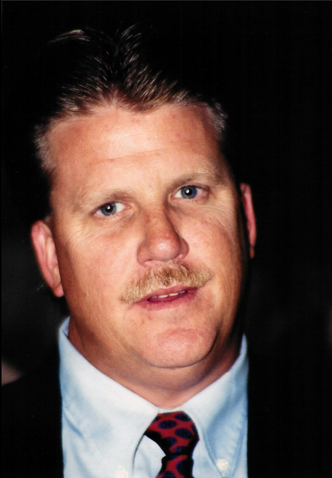
Teamsters Local 89 General Meeting September, 2002