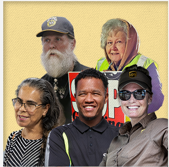
THE WORKING CLASS