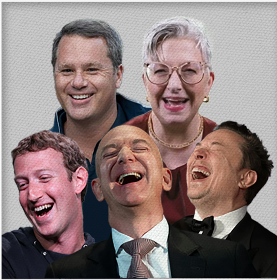
THE RULING CLASS